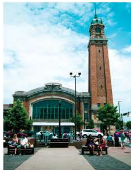
ILLUSTRATION BY REDDIN DESIGN

The Rock & Roll Hall of Fame's big night out rotates between New York City and Cleveland — and next year it's the CLE's turn. The Class of 2018 won't be announced until later this year, but whoever makes the cut, the party will be great.